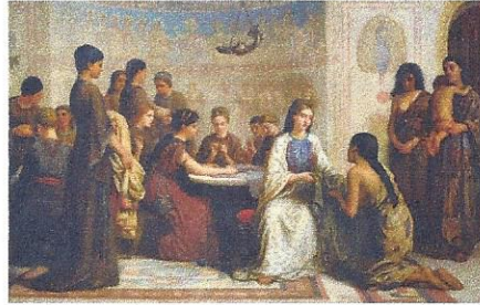
Dorcas at home ministering to other women.

Loved by the community for her kind heart and benevolent nature, Dorcas likely launched the first Christian nonprofit, using her talents as a seamstress to provide clothing for the poor, especially widows.