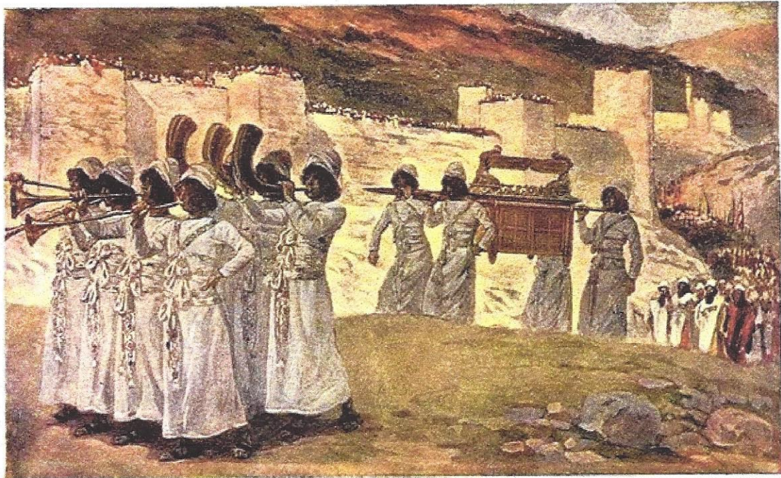
J. James Tissot.

Did you know that Rahab married an Israelite and is one of Jesus' ancestors? She is one of only four women listed in Jesus' genealogy.