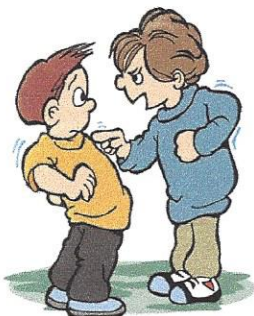
Yelling at a friend

Point to the pictures of boys and girls who you would choose as friends.