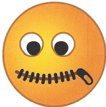
God stopped talking to them.