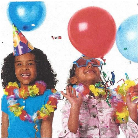
God through them a party

Jeremiah was sent by God to warn the people to start obeying God, but the people would not listen. What do you think happened to the people?