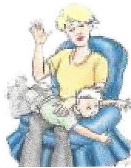
God punished them